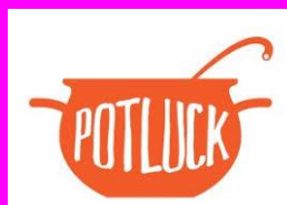
[Image Description: A picture of an orange pot with the word "potluck."]

This edition's accessibility idea for your Deaf ministry and extended community is accessibility for your potluck/covered dish gatherings . Some people have food allergies, while other people have difficulty navigating steps to get to a certain room. For many Deaf ministries (and hearing ministries), gathering for a potluck or covered dish is a way to meet new people and have fellowship. It's often where relationship building happens. Be sure to consider accessibility concerns, such as posting "this food item may have nuts" or "Gluten Free." If your gatherings occur in nearby restaurants, then be sure they're accessible by public transportation, are wheelchair accessible (and has accessible parking), and/or have adequate lighting (for Deafblind persons). Help your Deaf ministry potluck/covered dish be better accessible.