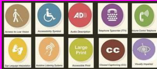
[Image Description: 10 disability symbols, such as low vision, captioning, large print, and audio description.]

This edition's accessibility idea for your Deaf ministry and extended community is accessibility for your potluck/covered dish gatherings . Some people have food allergies, while other people have difficulty navigating steps to get to a certain room. For many Deaf ministries (and hearing ministries), gathering for a potluck or covered dish is a way to meet new people and have fellowship. It's often where relationship building happens. Be sure to consider accessibility concerns, such as posting "this food item may have nuts" or "Gluten Free." If your gatherings occur in nearby restaurants, then be sure they're accessible by public transportation, are wheelchair accessible (and has accessible parking), and/or have adequate lighting (for Deafblind persons). Help your Deaf ministry potluck/covered dish be better accessible.