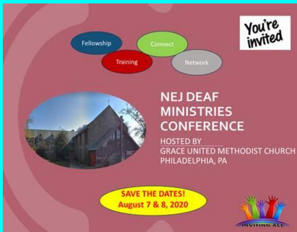
[Image Description: A flyer of the NEJ Deaf Ministries Conference scheduled Aug 7-8, 2020 at Grace UMC in Philadelphia, PA.]

Are you following our Facebook pages? We post a variety of pieces: of course, we have stories from churches about Deaf and HOH ministry, but also stories about Deaf and HOH people, notices about scholarships, news about products, tips and general advice about hearing aids, safety, and similar items. Check them out at our Facebook page .